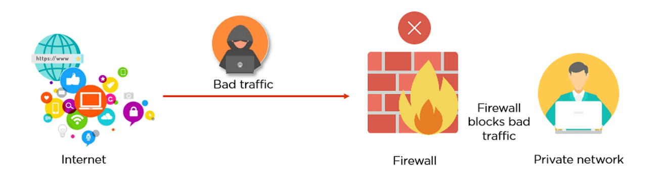
Fig: Firewall blocking Bad Traffic

However, in the example below, the firewall blocks malicious traffic from entering the private network, thereby protecting the user's network from being susceptible to a cyberattack.