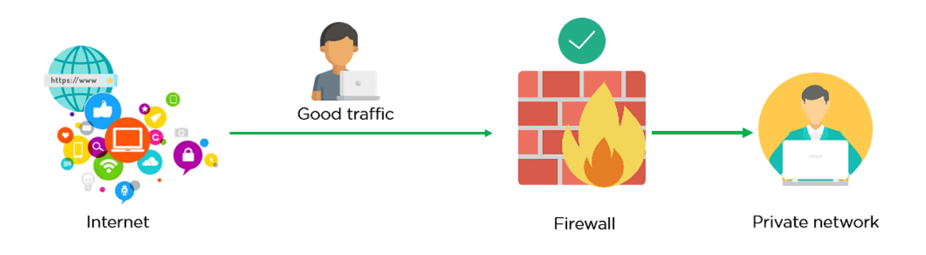
Fig: Firewall allowing Good Traffic

However, in the example below, the firewall blocks malicious traffic from entering the private network, thereby protecting the user's network from being susceptible to a cyberattack.