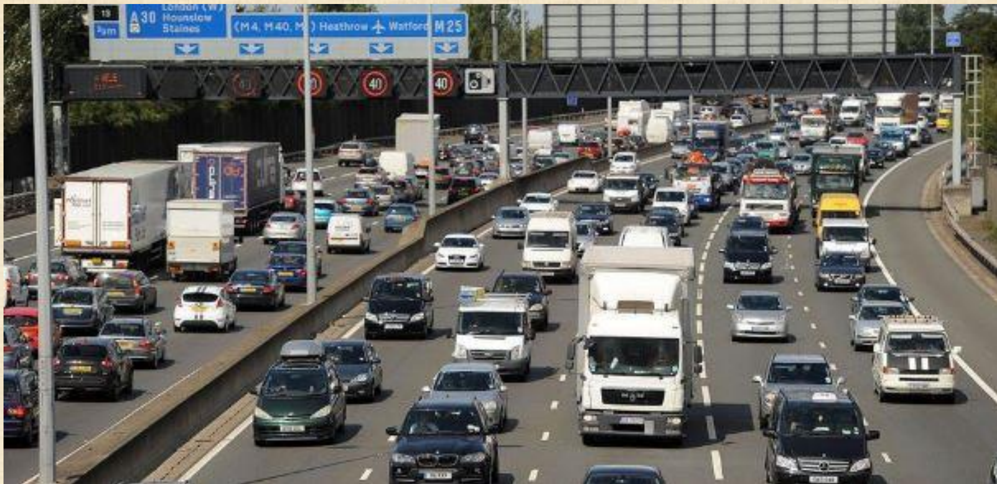
Traffic jam: City road in Europe