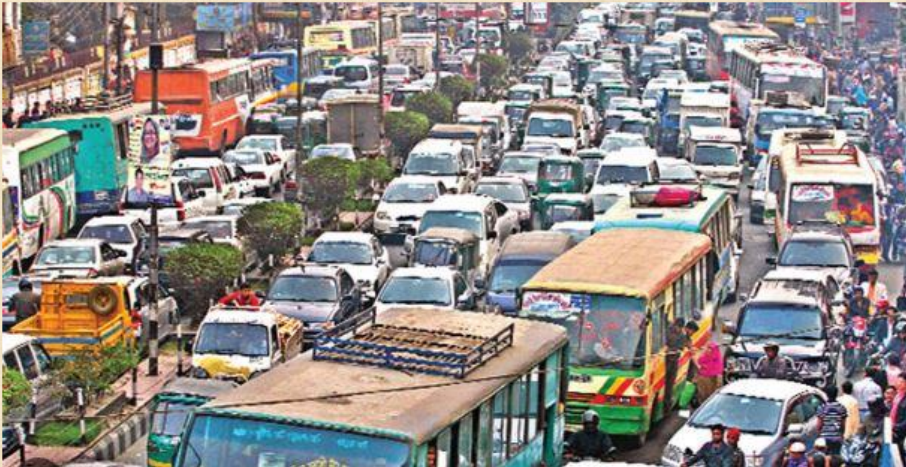
Traffic jam: The ugly side of Dhaka's development