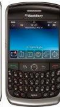
BlackBerry Curve 8900