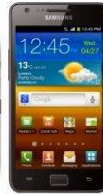
Samsung Galaxy S2