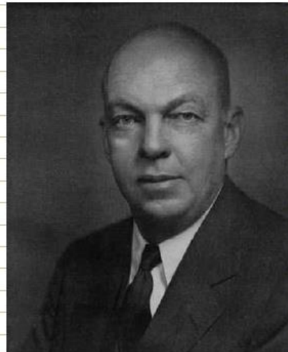
Edwin H. Armstrong (1890-1954)