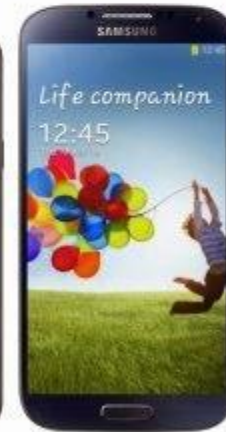
Samsung Galaxy S4