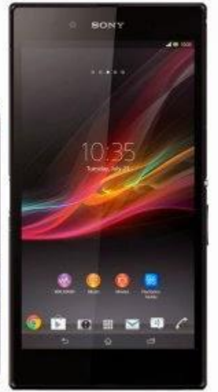
Sony Xperia Z Ultra