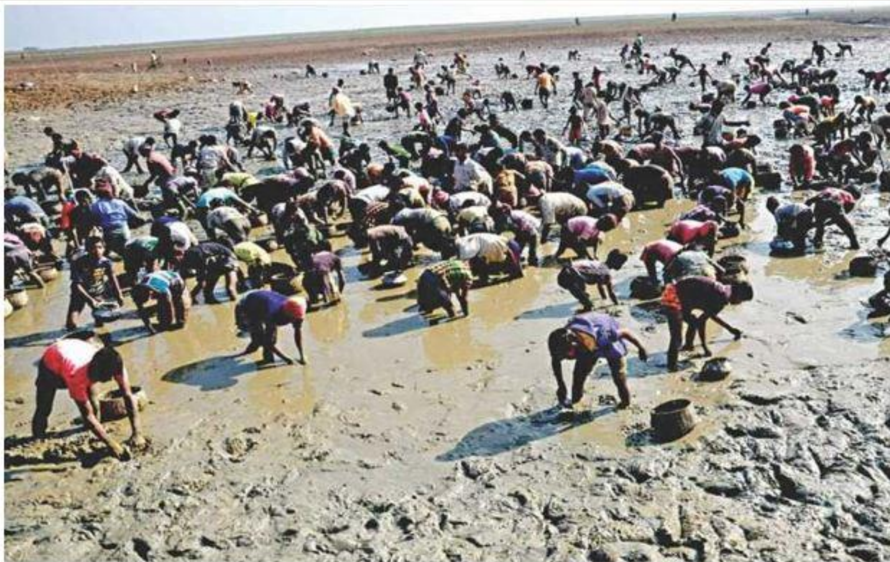
People catching fishes from a wetland after drying it up by removing water. This causes destruction of the fish habitat, thus affecting further breeding. The photo was taken in Haor area of Companiganj in Sylhet recently.