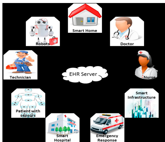
Fig. 1 The components of a smart health system

s-Health is a new form of healthcare which is a subfield of e-Health using Electronic Health Records (EHR) and other variables coming from the smart city’s infrastructure; in order to improve the healthcare. The idea of a smart health system is that it uses all data coming from sensors on the patient body, smart homes, smart city infrastructure, and robots to help make better decisions and improve healthcare by providing emergency response and paging doctors, nurses, and technicians (see Fig. 1). It can also support self-diagnosis, monitoring, early detection and treatments.